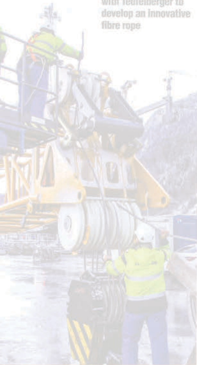
Libherr is working with Teufelberger to develop an innovative fibre rope

The Star lifts are among the first machines to feature Haulotte's ACTIV diagnostic screen, built into the base structure of the platform. ACTIV is to be fitted as standard across the platform range, with ACTIV 2 on larger models. www.haulotte.com