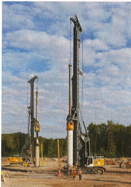
Two Liebherr LB 44-510 rotary drilling rigs are creating the foundations for the international particle accelerator in Germany

a double rotary, which allows casing and the drill string to be advanced independently.