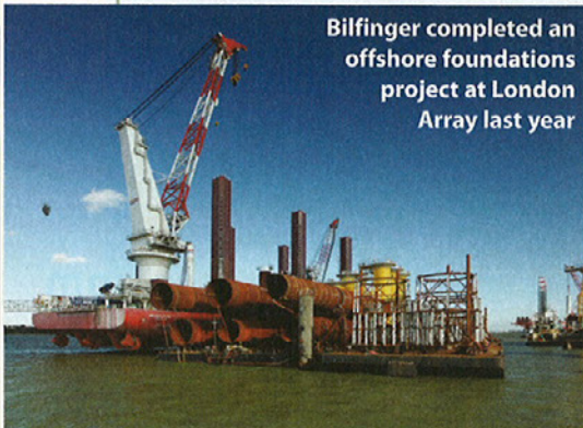
Bilfinger completed an offshore foundations project at London Array last year

In recent years, the group has delivered the foundations for a large proportion of the wind farms built in the North Sea and Baltic Sea. The foundation work for Dan Tysk in the German North Sea was completed in 2013, and in 2012 the company also concluded work in the UK for London Array in the Thames Estuary.