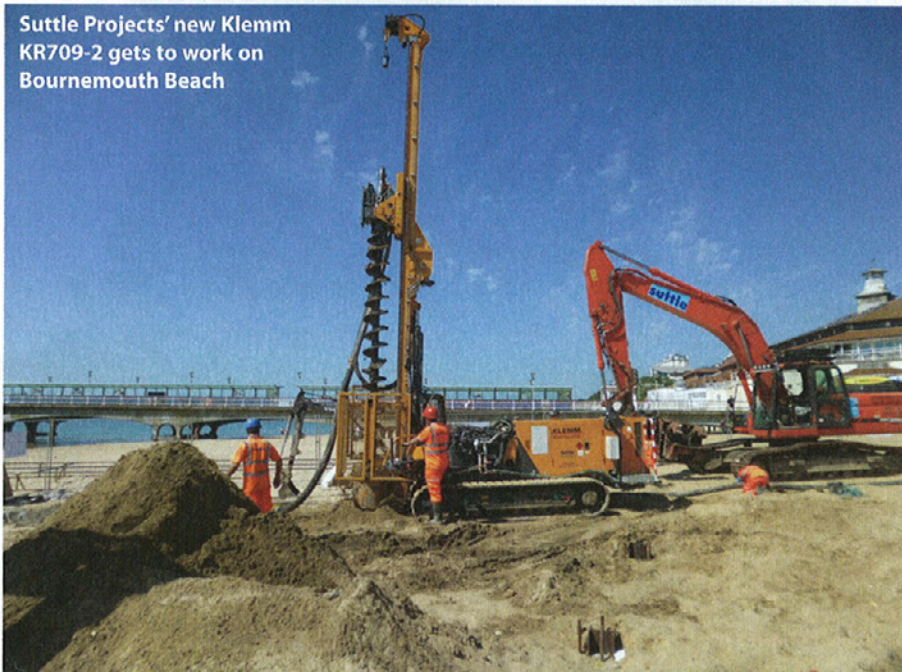
Suttle Projects' new Klemm KR709-2 gets to work on Bournemouth Beach

UK site preparation specialist Groundforce has been working with the Nuclear Advanced Manufacturing Research Centre (NAMRC) in the north of England, on a special foundations project.