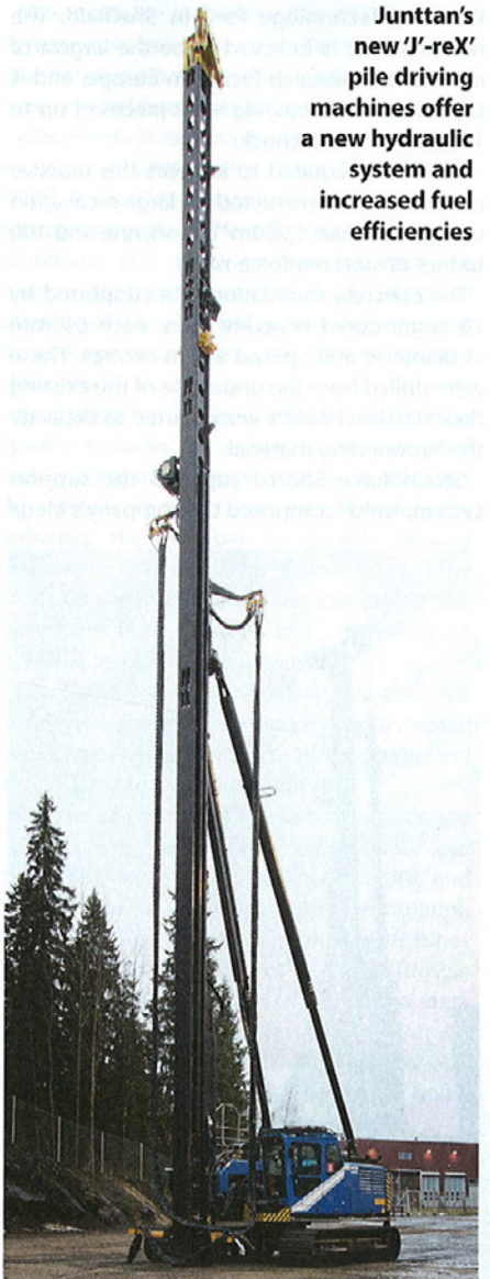
Junttan's new 'J-reX' pile driving machines offer a new hydraulic system and increased fuel efficiencies

Tensor International's TriAx soil reinforcement system has been brought in to overcome challenging ground conditions at England's largest wind farm site. It provided a multi-directional geogrid product for the construction of 24km of access road for the Keadby wind farm site, in North Lincolnshire.