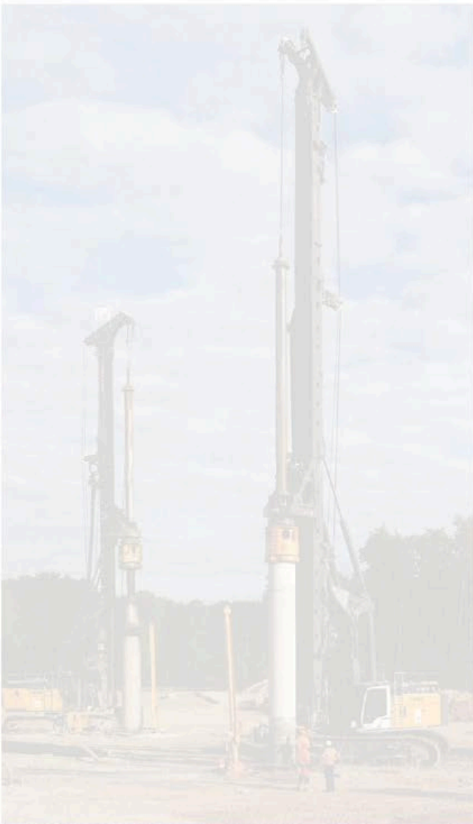
Two Liebherr LB 44-510 rotary drilling rigs are working on the construction of the Facility for Antiproton and Ion Research (FAIR), drilling 1,400 piles, measuring between 40 m and 62 m.

UK manufacturer BSP International Foundations has supplied a CX110 piling hammer to Moroccan contractor SGTM for