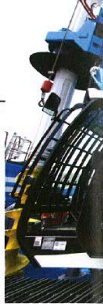
A Kobelco CKE2500G pile driver gets to work on the Huisman quay in Brazil. Each pile is up to 44 m long and weighs nearly 25 tonnes.

the largest and most powerful rotary drilling rig currently in operation in Germany.