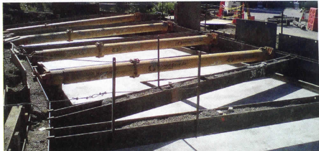
Hydraulic struts in place on shoring.