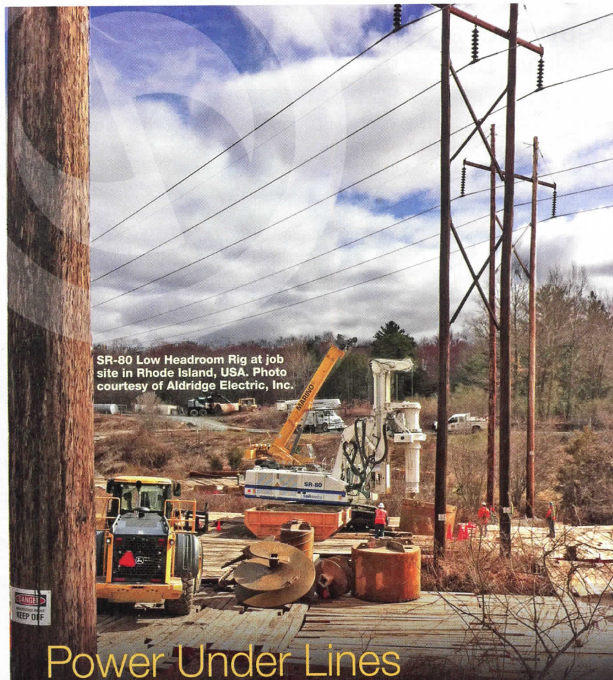
SR-80 Low Headroom Rig at job site in Rhode Island, USA.